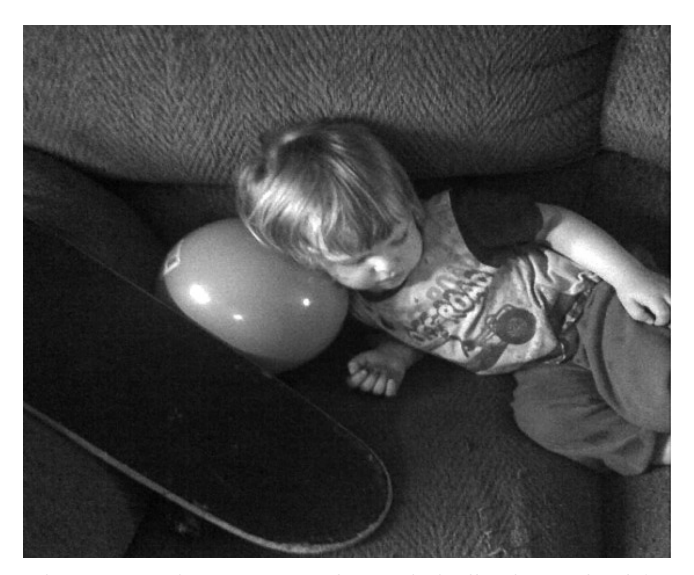
This young man has Huntington's disease which affects his mood and sleep so profoundly that he has severe anxiety and paranoid delusions. With the care he received at our office from the pediatric chiropractor, myself and the recreational therapist, he started laughing in May of this year, and also started school in the Spring. His life has been dramatically changed. (Picture used with permission)

In our practice, we have found that while sometimes prescription medication is the current intervention being employed, it is often possible to deduce the underlying triggering factors through careful history taking and appropriate testing. Each child is assessed individually for structural integrity, nutritional factors, detoxification and genetic predispositions which indicate therapeutic doses of nutrients, amino acids therapy, or diet changes. Tics, irritability, insomnia, anxiety, depression and low mood, as well as physical ailments such as chronic diarrhea or constipation, asthma, and other chronic diseases have completely vanished with this process of correcting subluxation,